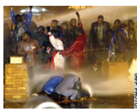
Firing water cannons