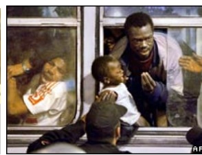
Protesters loaded on buses